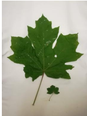
large leaf, small leaf