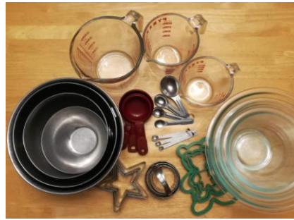
All sorts of shapes and sizes in the kitchen-- they tend to "stack up"