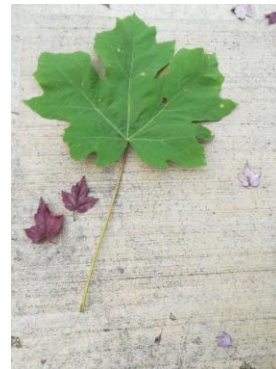
one big, two small