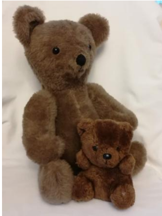
Big bear, little bear